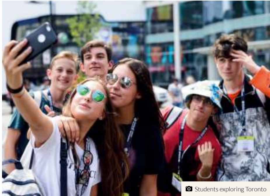
Students exploring Toronto