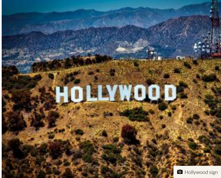
📷 Hollywood sign

English levels: Elementary - Proficiency (programme can be adjusted to lower than elementary).