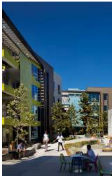
📷 CSUN campus