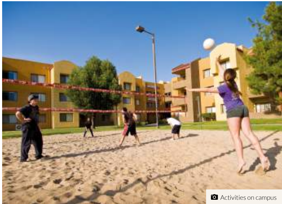
📷 Activities on campus