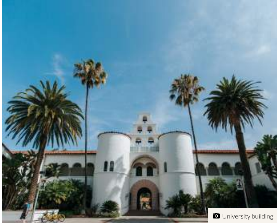
📍 University building

Note: The San Diego State University name is strictly for the purpose of identifying the location at which Oxford International Junior Programmes are delivering the programme. Oxford International Junior Programmes have no affiliation with San Diego State University and is not involved in or responsible for the quality, suitability, delivery or other aspects of Oxford International Junior Programmes in any way.