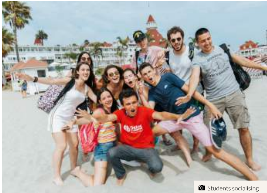
📍 Students socialising