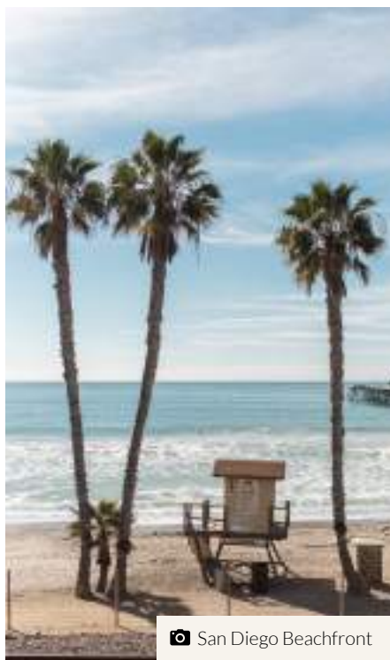
📍 San Diego Beachfront