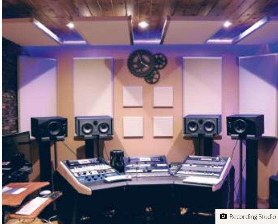
📷 Recording Studio

English levels: Elementary - Proficiency (programme can be adjusted to lower than elementary).